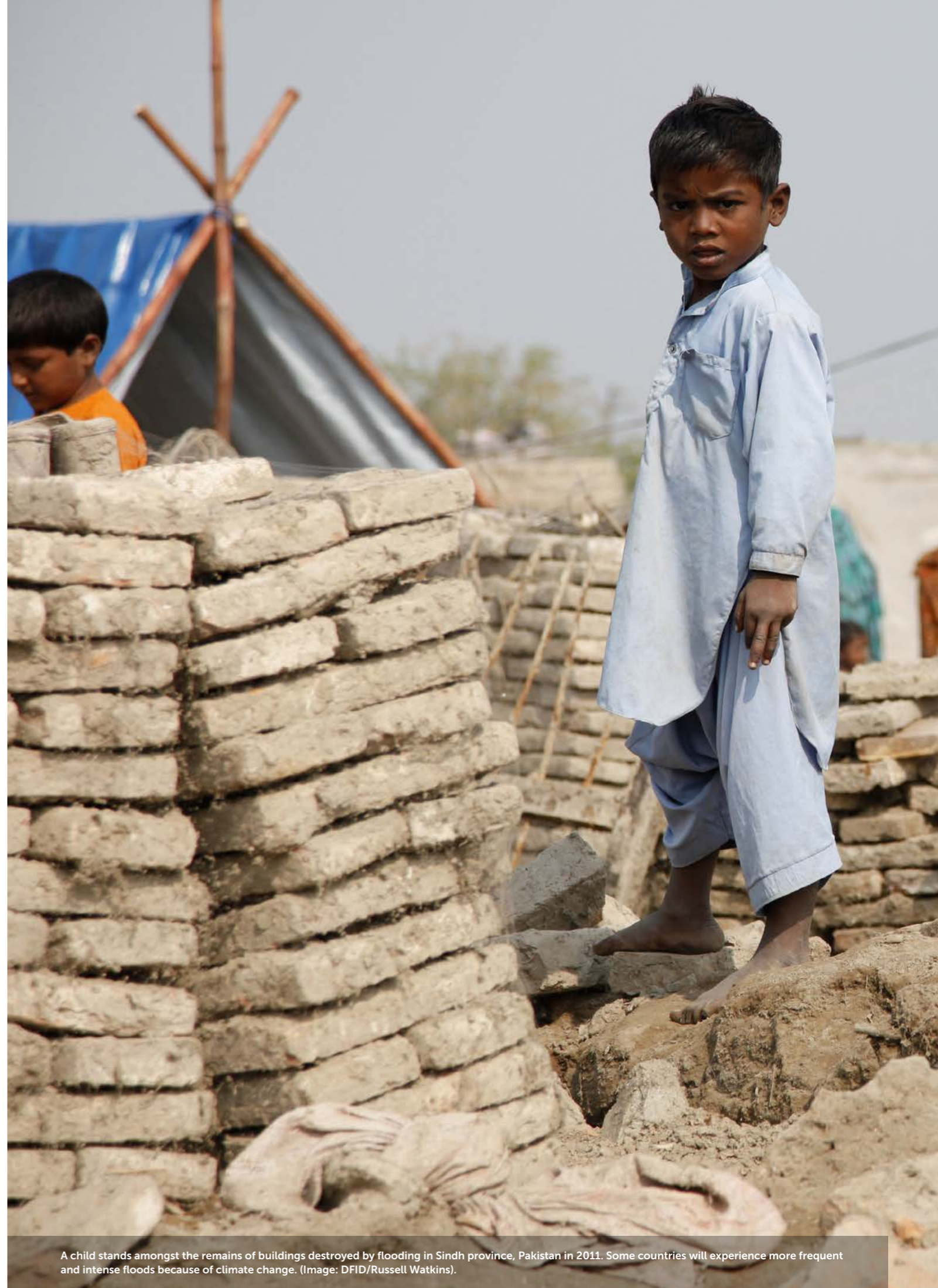
A child stands amongst the remains of buildings destroyed by flooding in Sindh province, Pakistan in 2011. Some countries will experience more frequent and intense floods because of climate change.