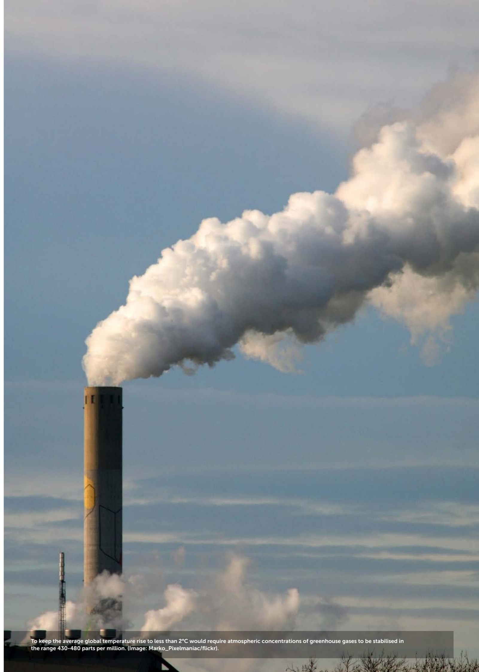
To keep the average global temperature rise to less than 2°C would require atmospheric concentrations of greenhouse gases to be stabilised in the range 430-480 parts per million.