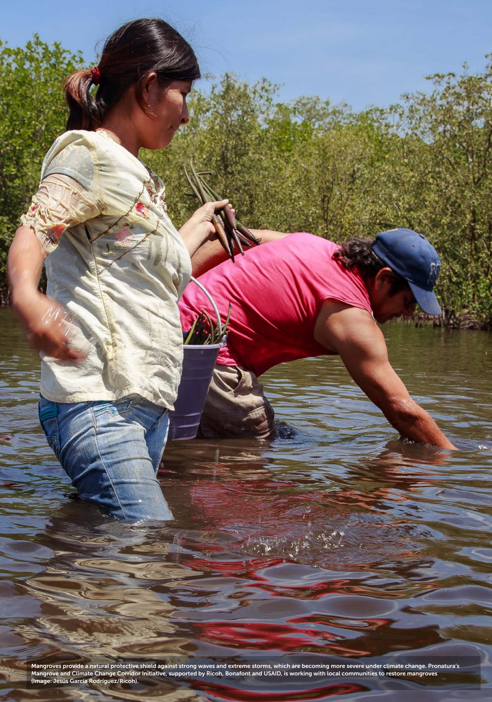
Mangroves provide a natural protective shield against strong waves and extreme storms, which are becoming more severe under climate change. Pronatura's Mangrove and Climate Change Corridor Initiative, supported by Ricoh, Bonafont and USAID, is working with local communities to restore mangroves.