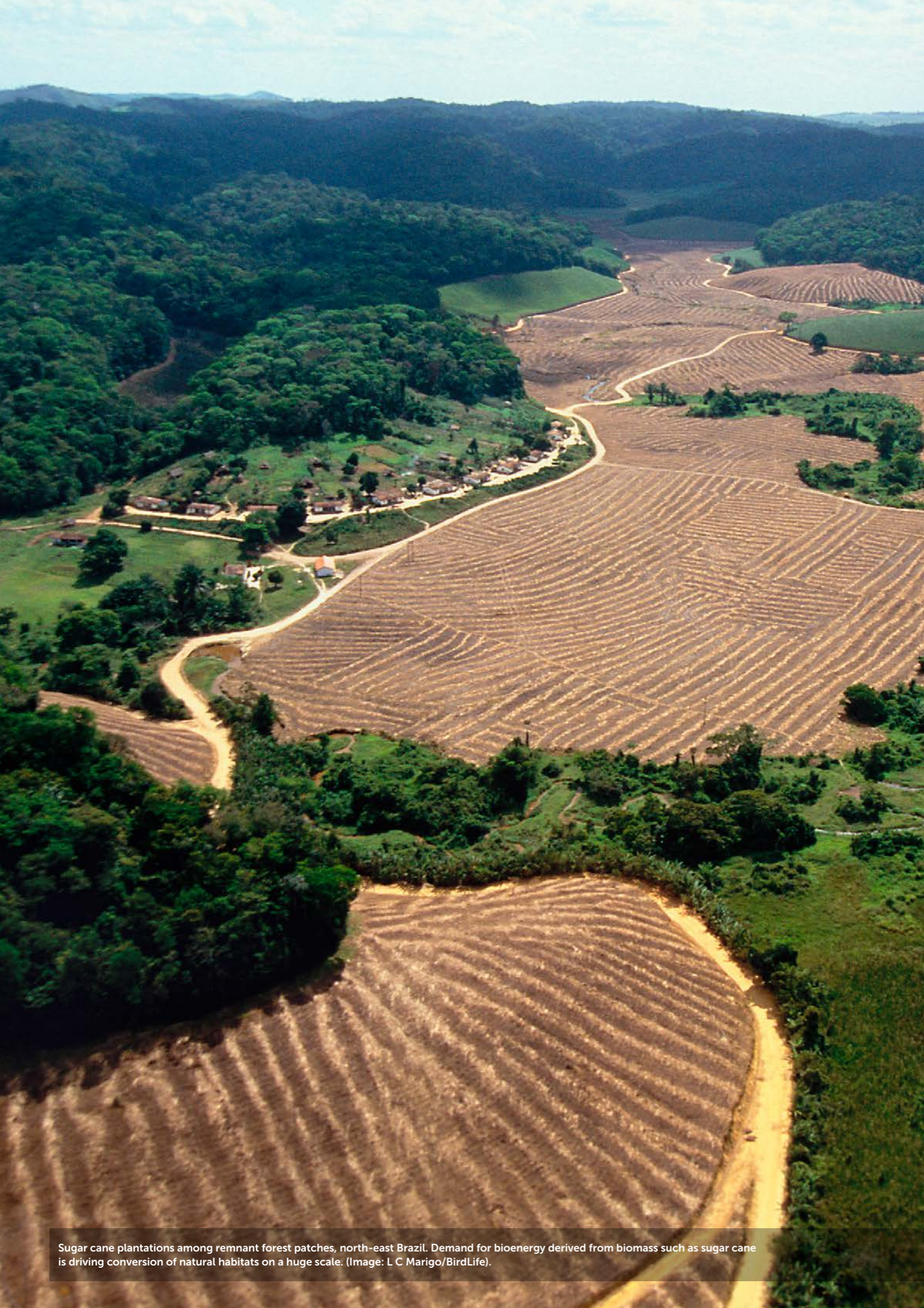
Sugar cane plantations among remnant forest patches, north-east Brazil. Demand for bioenergy derived from biomass such as sugar cane is driving conversion of natural habitats on a huge scale.