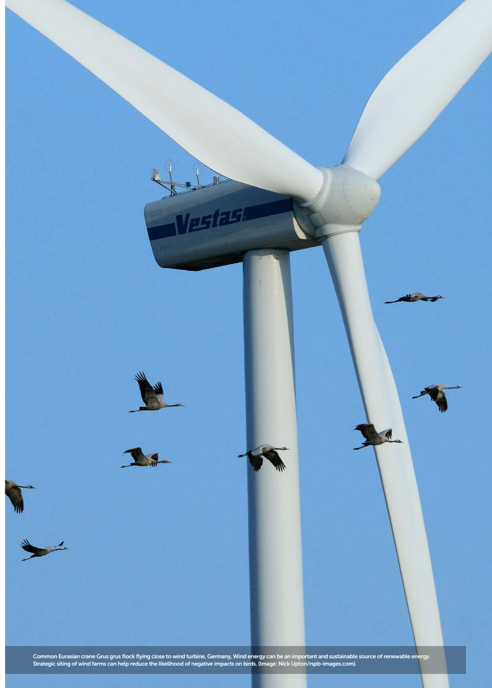
Common Eurasian crane Grus grus flock flying close to wind turbine, Germany, Wind energy can be an important and sustainable source of renewable energy. Strategic siting of wind farms can help reduce the likelihood of negative impacts on birds.