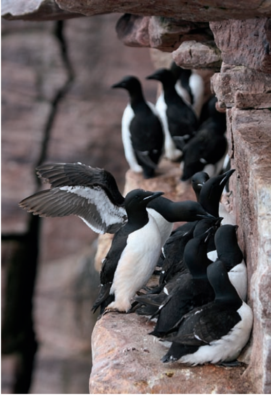
Thick-billed Murres breed on narrow ledges on cliffs. Polarlomvier yngler på smalle klippehylder.

observation of White-fronted Geese is new for the Carey Islands, and only the second ever for the species north of Melville Bay.