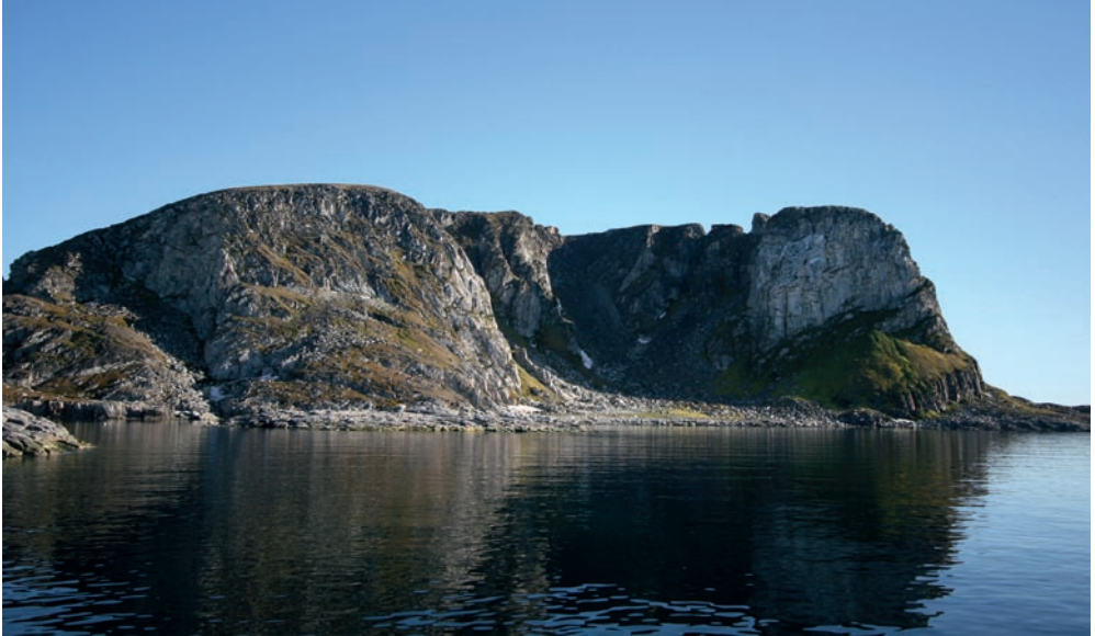
Northwestern part of Isbjørneø seen from NE. A few thousand Thick-billed Murres breed on the cliffs visible to the right in the photo, and lower numbers in the center and to the left.

Nordvestlige del af Isbjørneø set fra NØ. Fjeldsiden i billedets højre side er yngleplads for nogle få tusinde Polarlomvier, og mindre antal yngler også i billedets midte og venstre side.